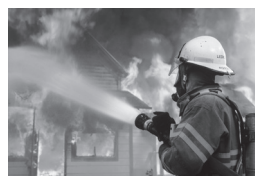
5 firefighter / surgeon