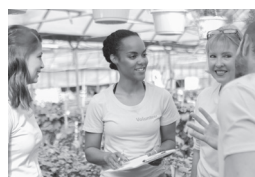
3 volunteer / lawyer