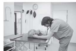
2 firefighter / vet