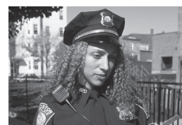
4 paramedic / police officer