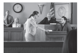
6 volunteer / lawyer