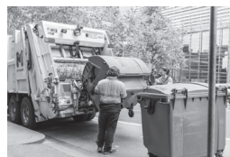
1 refuse collector / paramedic