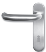
3 button / handle