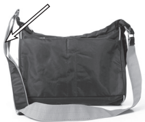
1 strap / handle