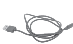
5 cable / key