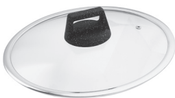
4 lid / cover