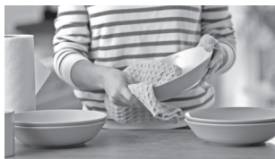
dry the dishes

Use the clues and the photos to help you.