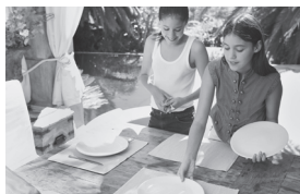
set the table