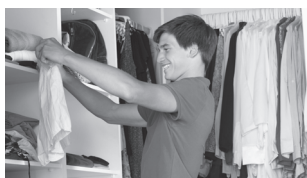
tidy my room