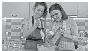
help with cooking