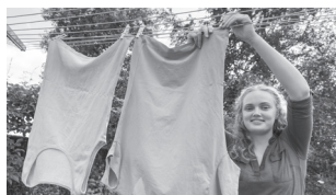
hang out the clothes