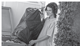
take out the rubbish